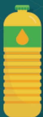
Palm oil substitute