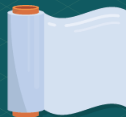
Organic acids e.g. for bioplastic production