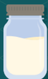
Cheese whey Waste